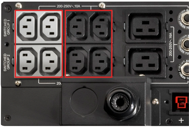
Independently control groups of output receptacles. (230V models only)