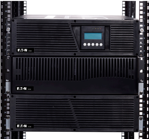
The 9135 (top) fits easily into a rack with a PPDM (middle) and an EBM (bottom)