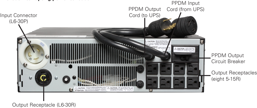
PPDM back panel input and output configuration.