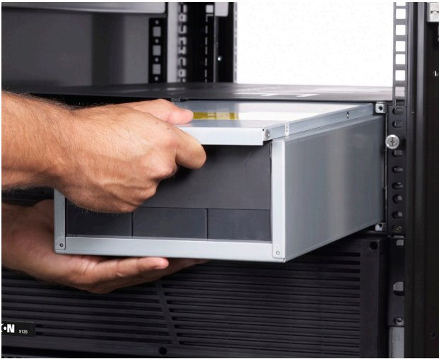
Even non-technical users can easily replace the hot-swappable batteries or power modules without interrupting power to loads.